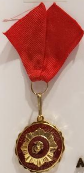
Associate Detachment Marine Of The Year Medallion M63 'A' Device M31A