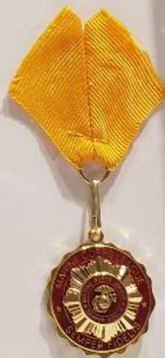
Associate Division Marine Of The Year Medallion M64 'A' Device M31A