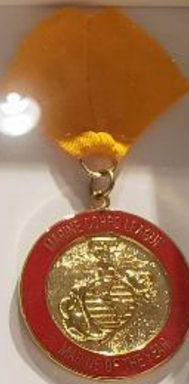
Division Marine Of The Year Medallion M62 FMF Device M30