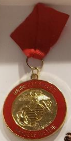
Detachment Marine Of The Year Medallion M60 FMF Device M30