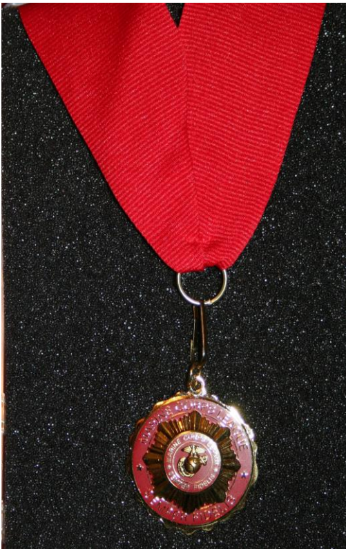
Bronze A Device