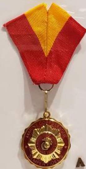
Associate Department Marine Of The Year Medallion M65 'A' Device M31A