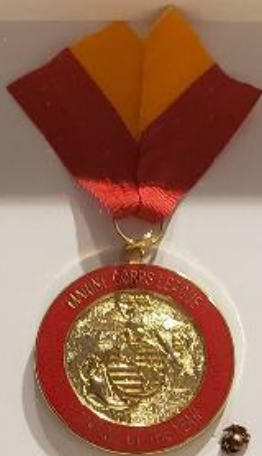
Department Marine Of The Year Medallion M61 FMF Device M30